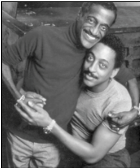
THE LATE GREGORY HINES WITH THE LATE SAMMY DAVIS JR.